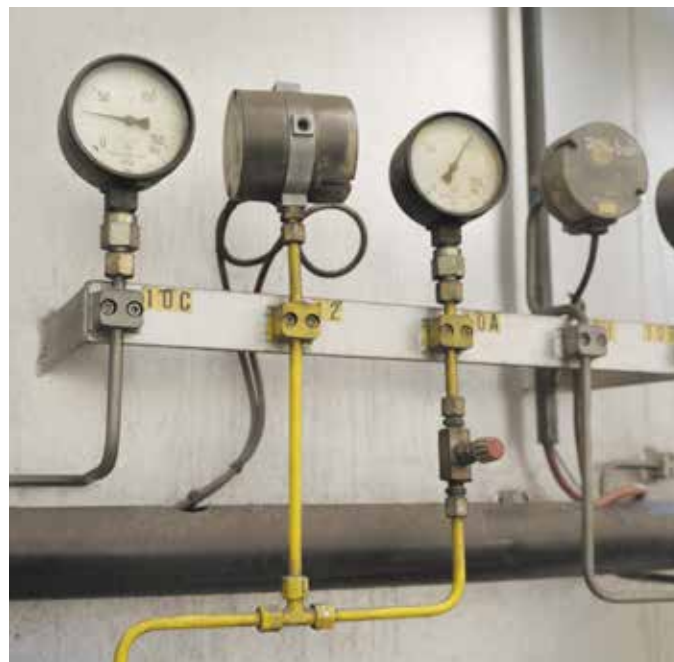
After 25 years of service