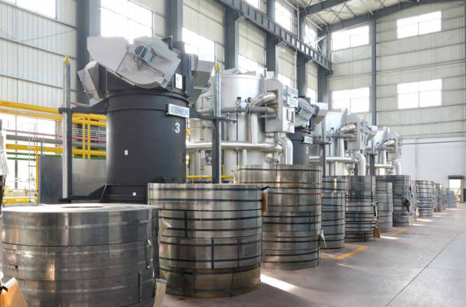
New facility and material