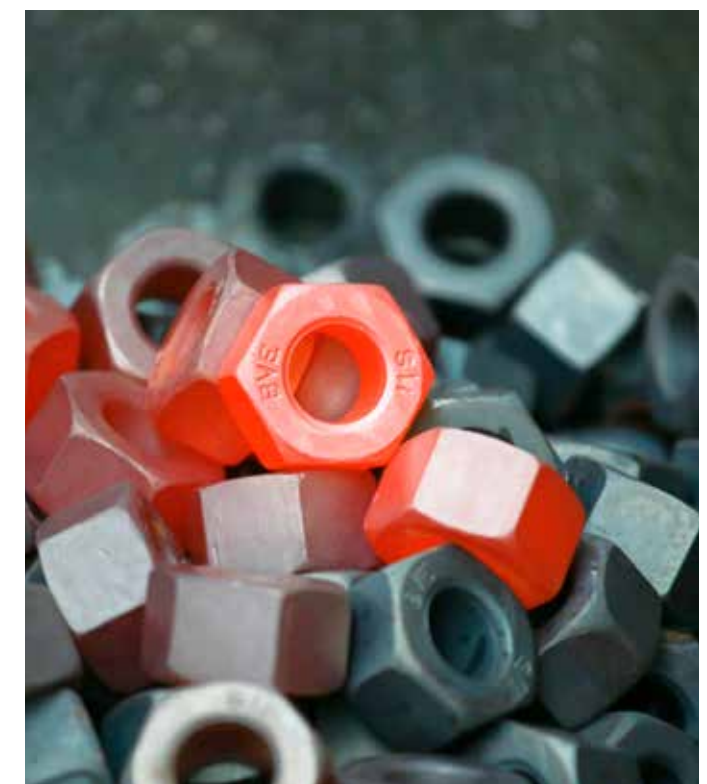
A quality product thanks to EBNER heat treatment