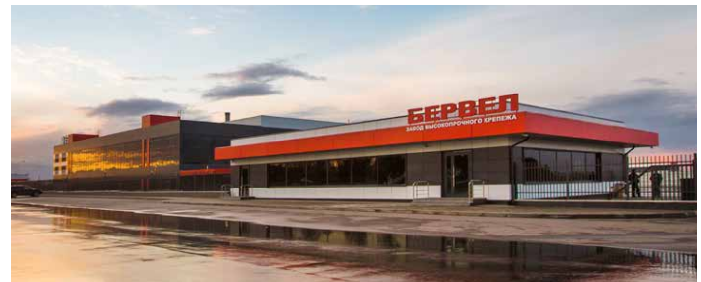
The new plant