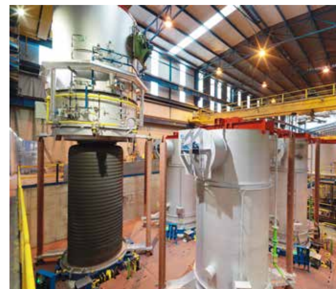
Facility in operation

Arania SA, a traditional company with more than 75 years of experience in manufacturing cold rolled steel strip, is located on Spain's northern coast, near Bilbao. Like EBNER, Arania relies on highest quality, safety and trust throughout the value-added chain.